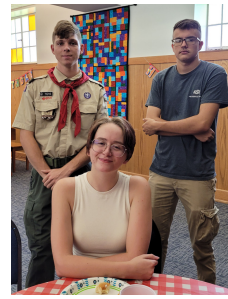
The Scouts joined us!