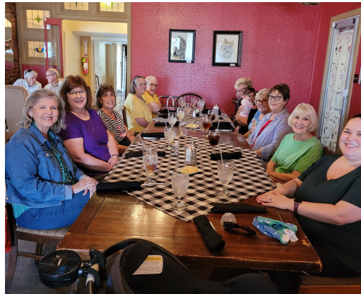
A great time was had by all at the August Girls' Lunch Out at Silver Spoon.